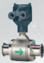
AXF Sanitary Flowtube