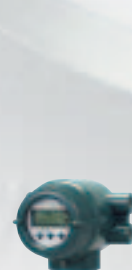
AXFA 14 Remote Converter