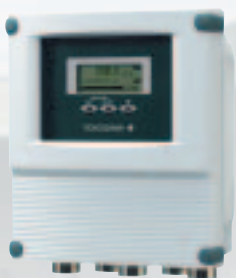
AXFA 11 Remote Converter

The LCD indicator employs a large, backlit, full dot matrix display. One to three lines are available to indicate a wide variety of display possibilities. Infrared switches permit programming through the glass without the need to open the enclosure cover.