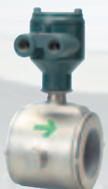
AXF Remote Flowtube