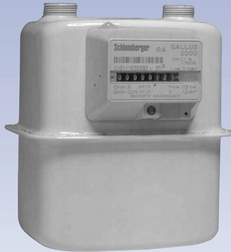
Gallus 2000 (steel body)