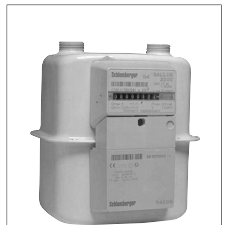
Gallus 400g (see product sheet)