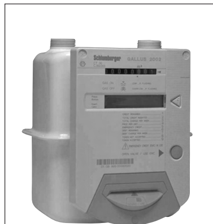
Gallus 2002 (Budget meter: see product sheet)