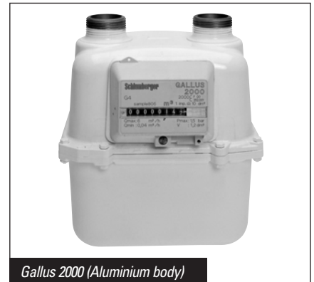
Gallus 2000 (Aluminium body)

The Gallus 2000 is made to measure accurately the volumes of natural gas (and LPG) used for domestic appliances. Please consult us for any other type of gas.